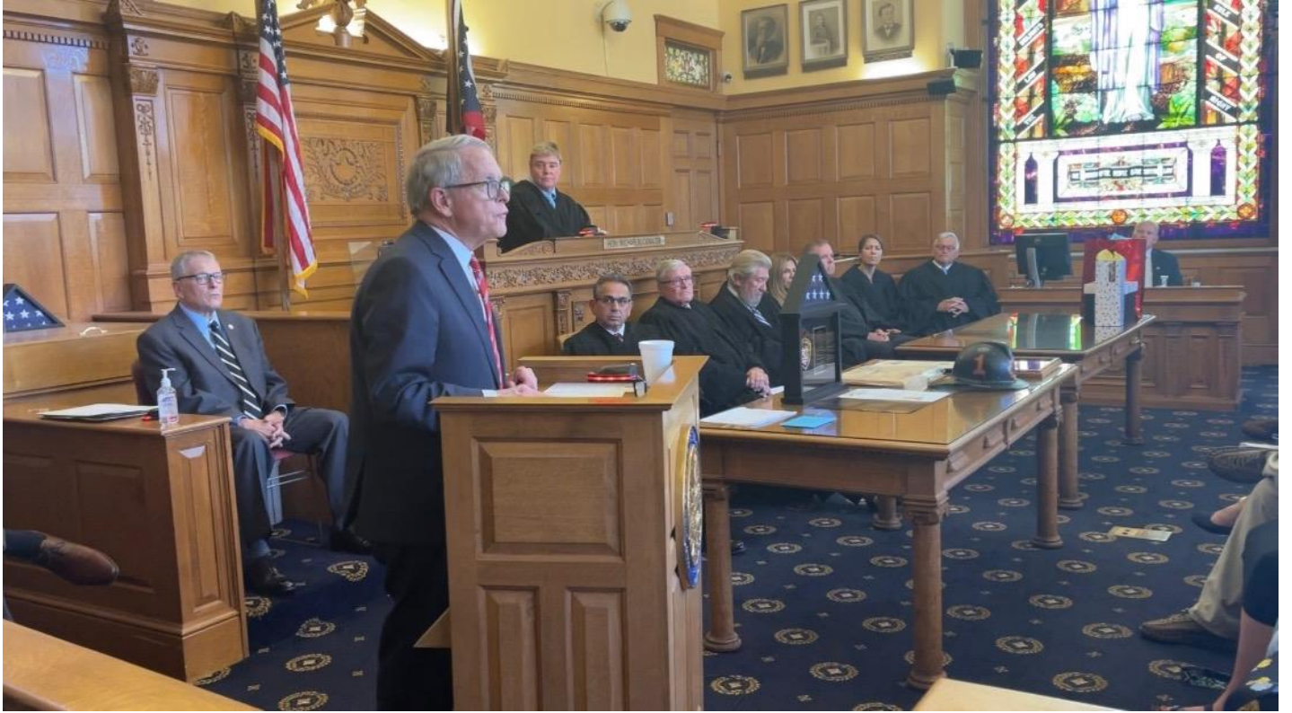
(Governor Mike DeWine speaking at the June 23, 2022, Retirement Ceremony)